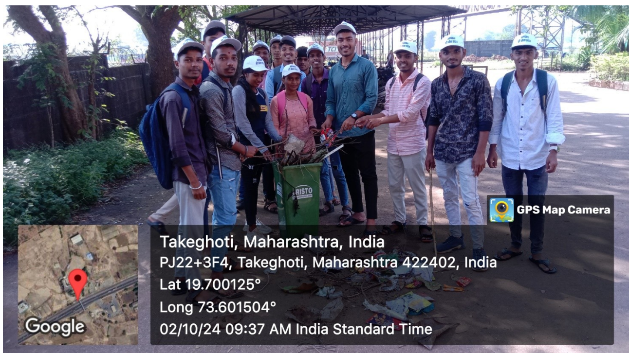
NSS Volunteers Cleaning the Campus