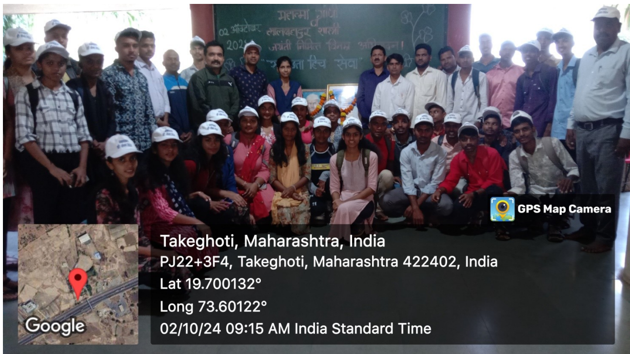
NSS Volunteers Cleaning Mahatma Gandhi Jayanti