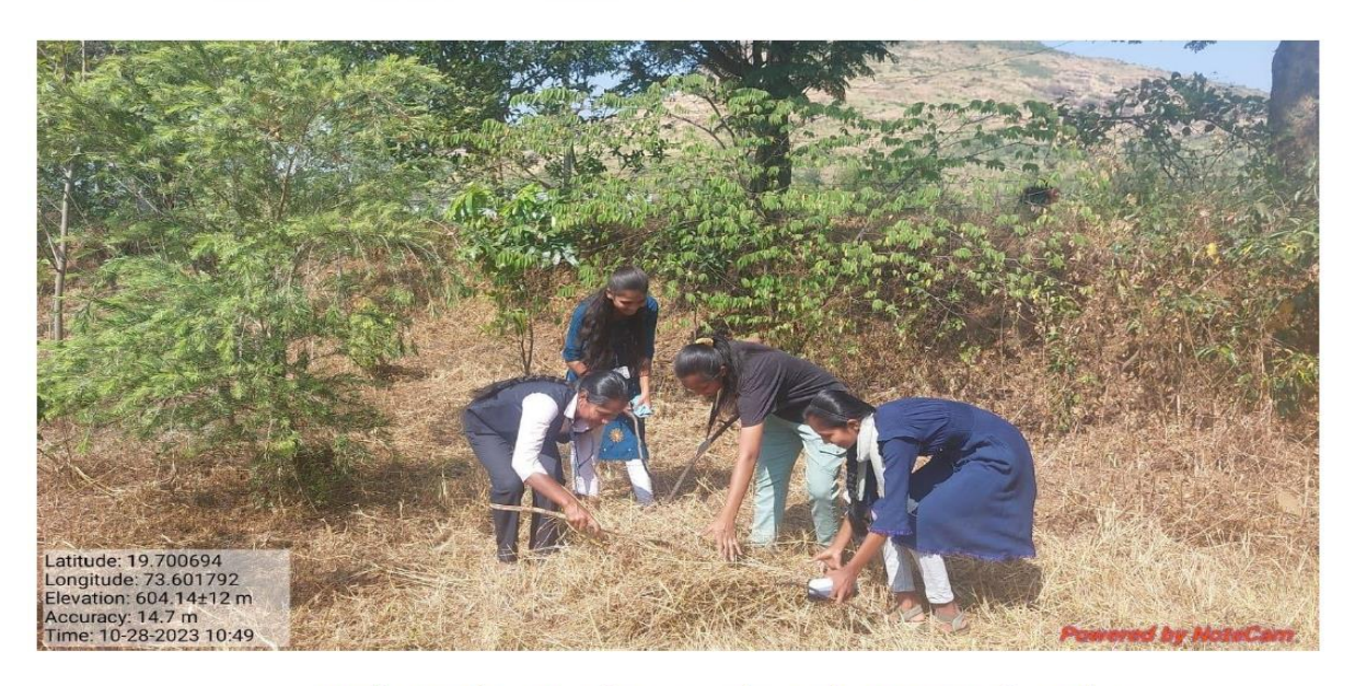
Students Cleaning the grass from the Botanical garden