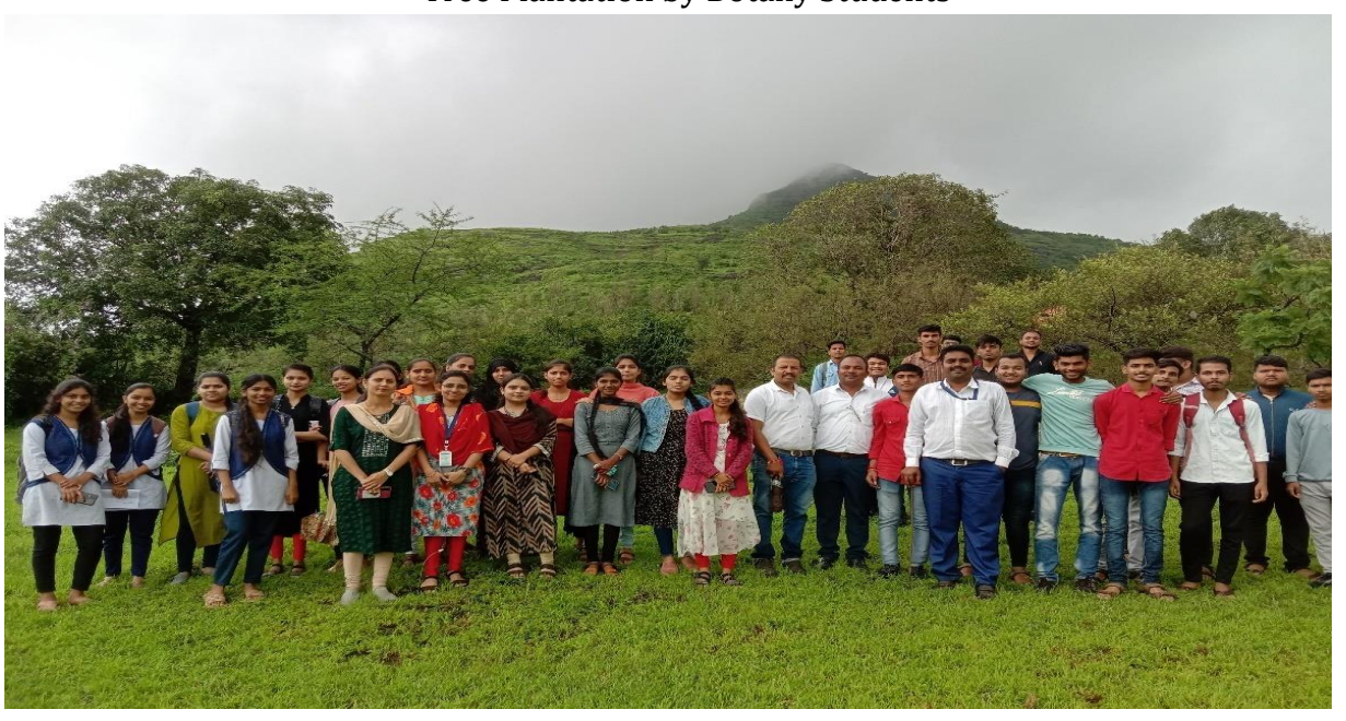
Geography, Zoology, Botany and English Department survey for tree plantation