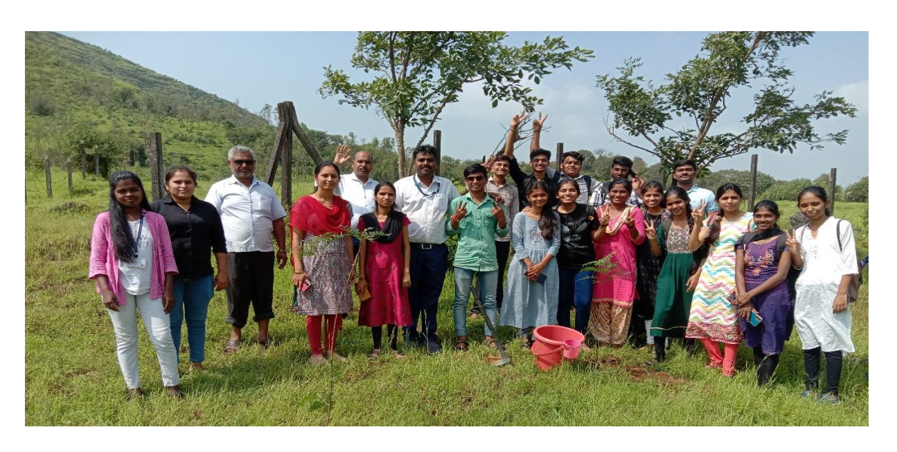
Tree Plantation by Botany Students