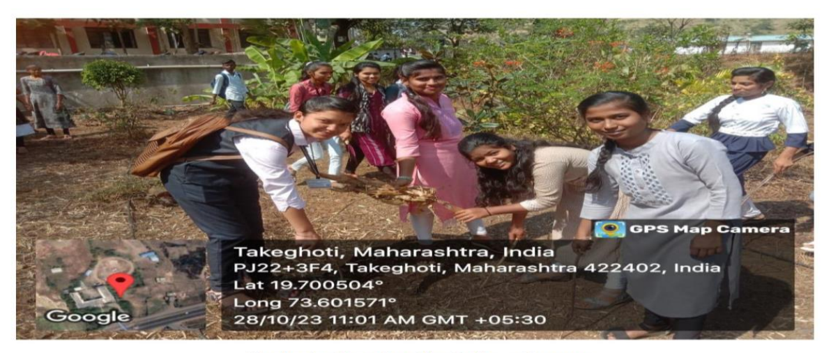
Students Cleaning the College Campus