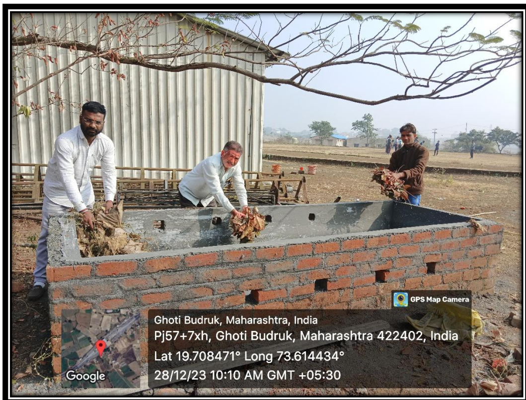
Varmi Composted Unit