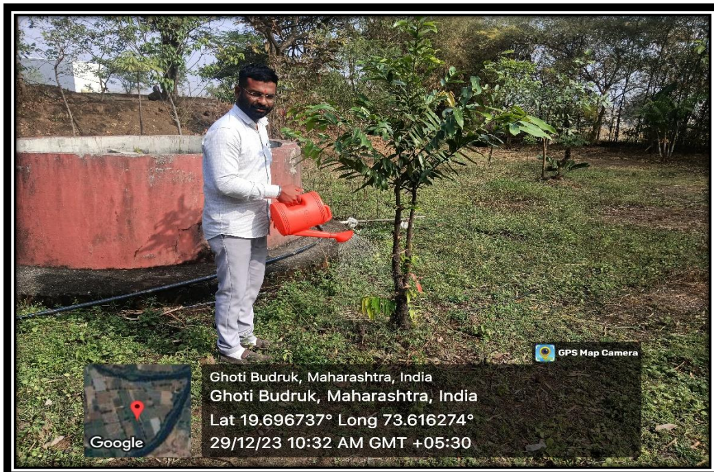
Water for plants