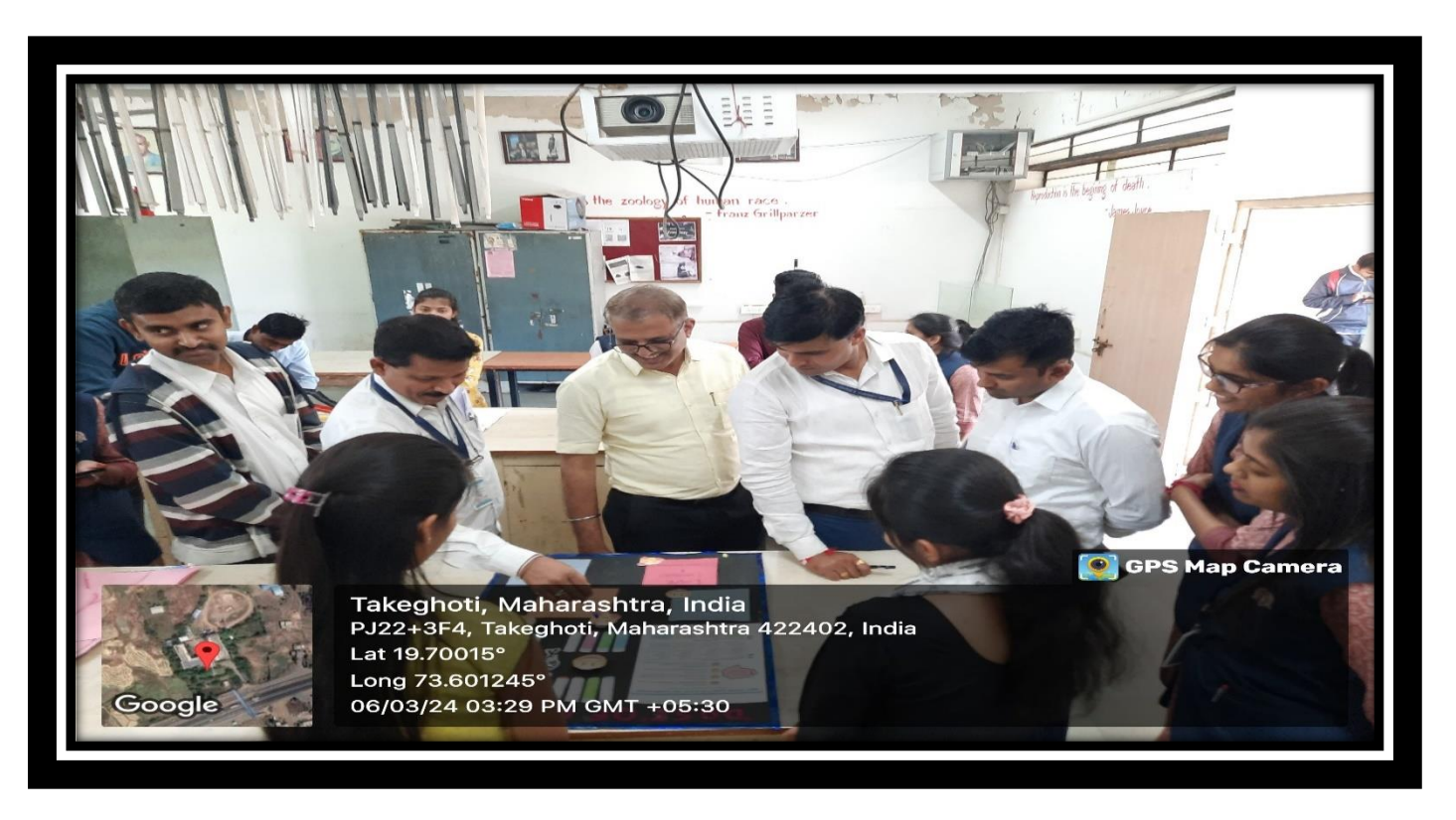
Examination of the Models presented by Students