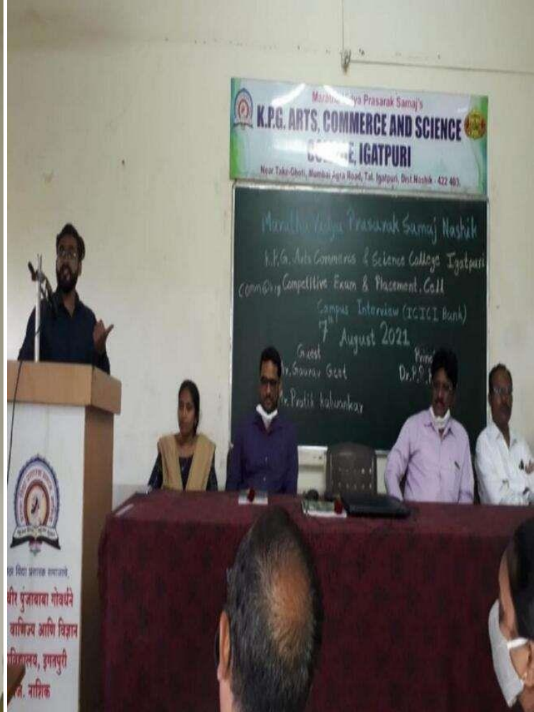
Date 7 August 2021 13:30